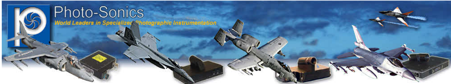
Photo-Sonics World Leaders in Specialized Photographic Instrumentation